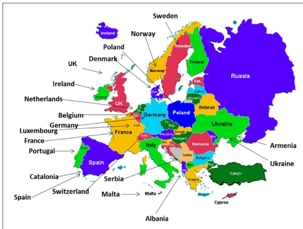
Figure 2. Countries surveyed.

palliative care, for example, extra fees may be available for palliative care home visits in Netherlands, Norway and Denmark, whereas in Luxembourg patients have to pay directly for home visits.